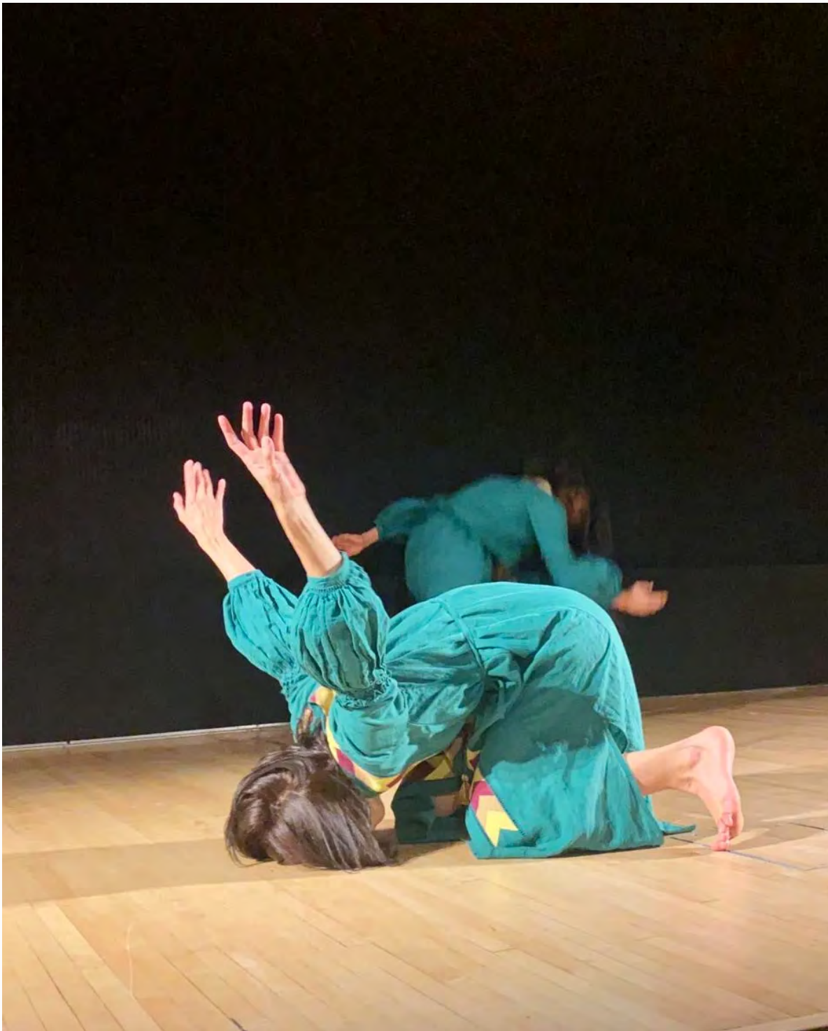
A still from "Infinita Compañía."