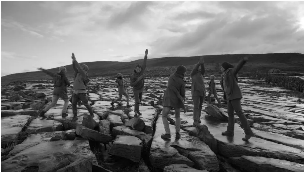
A still from "Navigation."