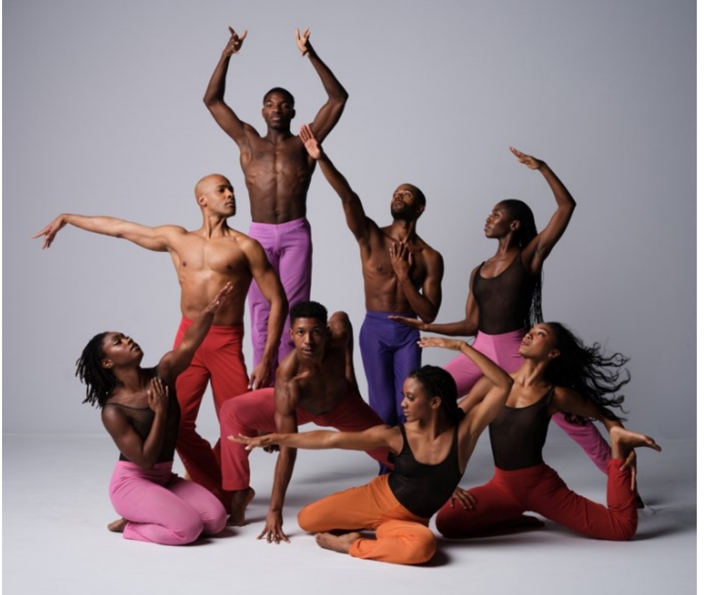
Alvin Ailey American Dance Theater in Judith Jamison's Hymn.